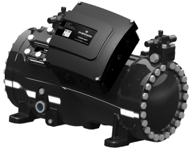
CO 2 compressor for transcritical & subcritical applications

The ZO range of Copeland Scroll™ compressors for subcritical applications and the semi-hermetic Copeland™ Stream compressors for subcritical and transcritical CO 2 applications have been developed specifically to leverage the characteristics of R744 refrigeration systems. Stream CO 2 compressors with high design pressures of 90/135 bar are dedicated to medium and low temperature CO 2 applications. ZO Scroll compressors with compactness and weight advantages are ideally suited for subcritical applications with CO 2 booster and hybrid systems. ZO Digital Scroll with digital capacity modulation provides a perfect match between capacity and load.