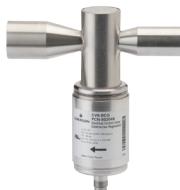
High Pressure Flow Control Valves Series CV