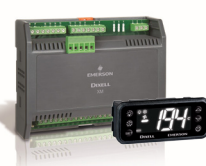
XM600 controller for display cases with EEV management