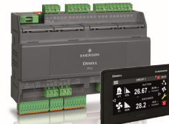
iProRACK for compressor rack control