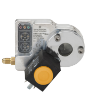
Electronic OilLevel Management System OM5

Emerson offers a wide range of valves and controls required for gas cooler, receiver and evaporator control in subcritical and transcritical applications. The product offering includes EX series high linear electrical flow control valves designed for a maximum operating pressure of 60 bar for subcritical applications and CV series valves designed for a maximum operating pressure of 120 bar for transcritical applications. The OM5 high pressure compressor oil regulator reduces the complexity of oil management system design.