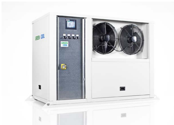
Crystal CCU is a multiple temperature range, compact condensing unit.