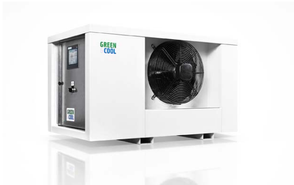
Mistral CCU is a single temperature range, compact condensing unit.